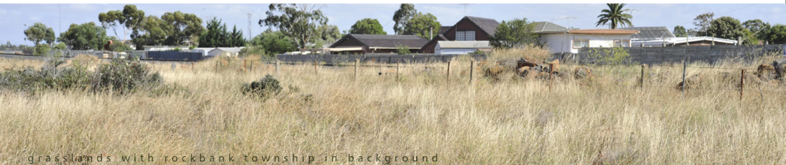
grasslands with rockbank township in background

Meanwhile at Cranbourne East where land is also about to become available, construction is already underway on a new school that has been fast-tracked under the new Urban Growth Zone provisions.