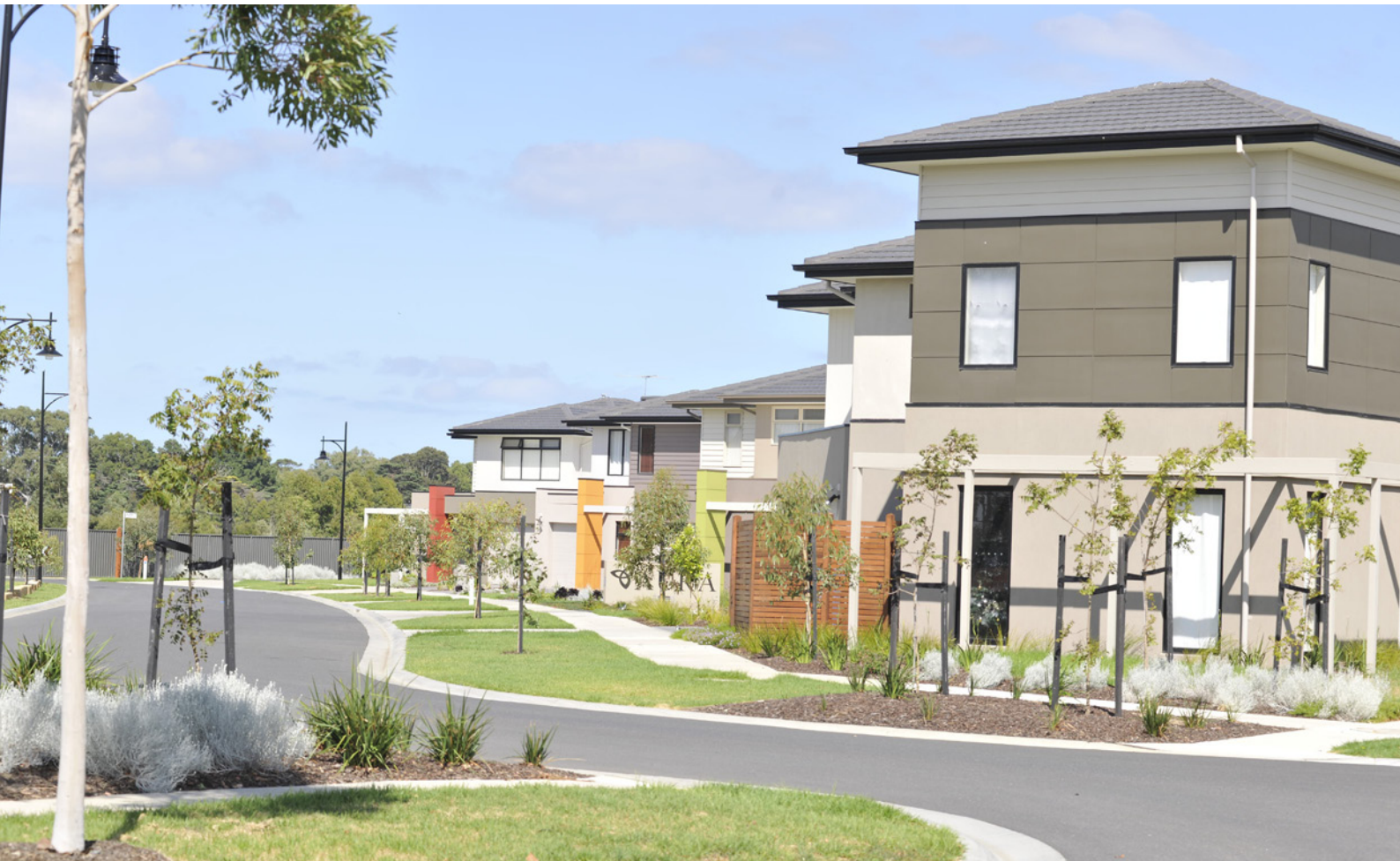
residential street with medium density housing