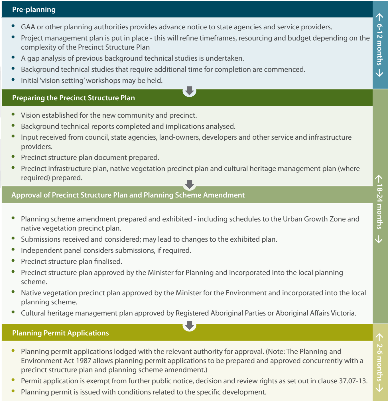
Figure 2: Planning Process Flowchart

The process for planning precincts in the growth areas is shown in the flowchart in Figure 2 below. Precinct structure planning should generally take 18 to 24 months to be prepared and incorporated into the local planning scheme.